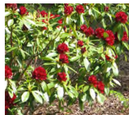
Examples of rhododendron varieties:

There are a large number of highly sought after species and varieties of rhododendron, of which the invasive Rhododendron ponticum is just one. It is unusual to encounter other varieties or species outside of planted habitats.