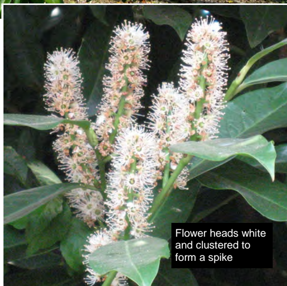
Flower heads white and clustered to form a spike